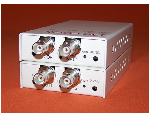
Mini Box, external power supply