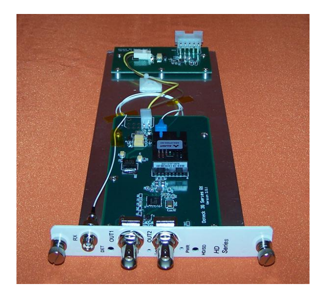
Fiber optic module