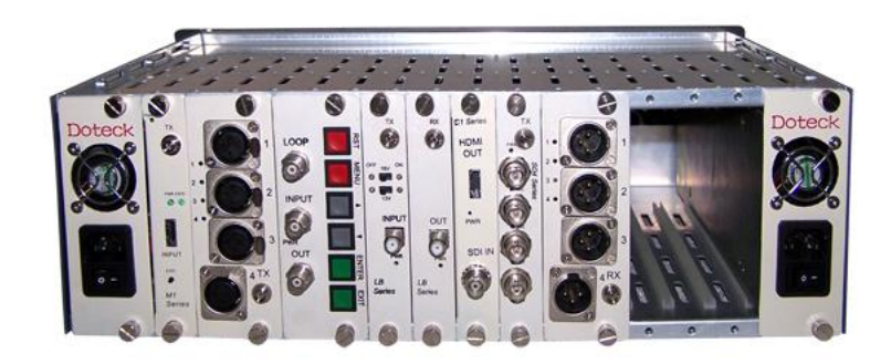
18-slot,19-inch 3RU,dual power supply