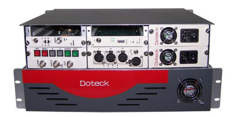
8-slot, 19-inch, dual power supply